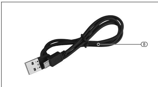
⑧ Micro USB cable.

As well as the worklight; there are separate parts not fitted or attached to it.